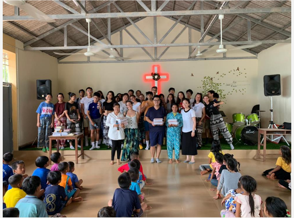
Second school visit